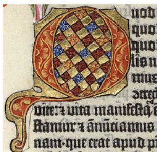
detail from Gutenberg Bible

The highlighting of the building's tracery in the lower parts of the illumination on its part quotes the colorized initial majuscules and arabesques ornating late gothic books.